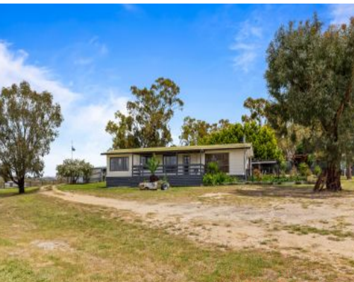
9 Station Street Pyalong, VIC