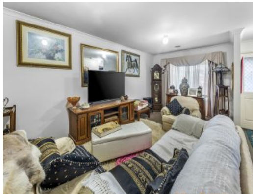
72 Cottage Crescent Kilmore, VIC