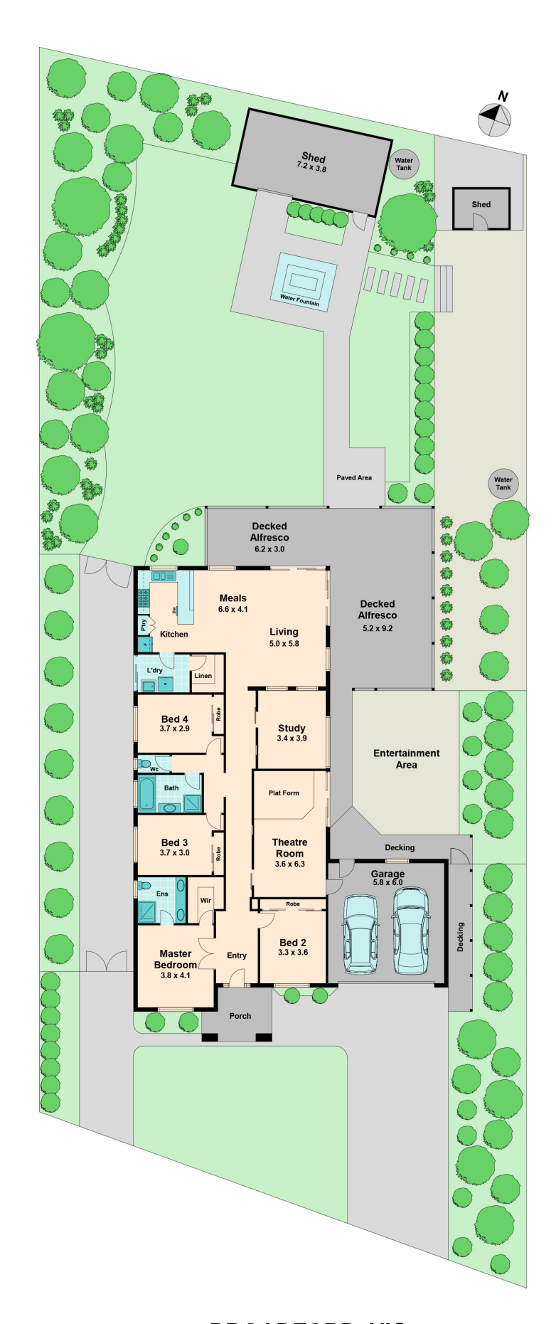
3 Alexander Drive