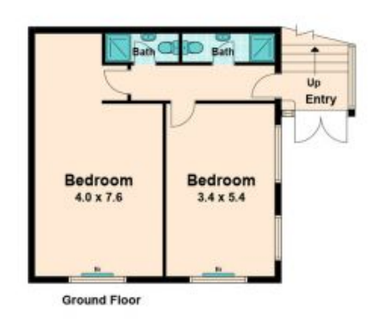
9 Powlett Street