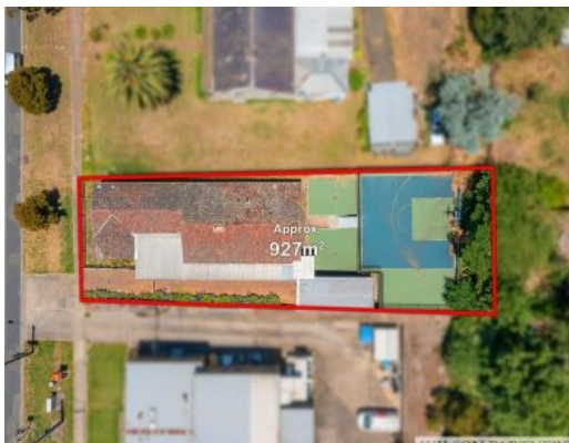
9 Powlett Street Kilmore, VIC