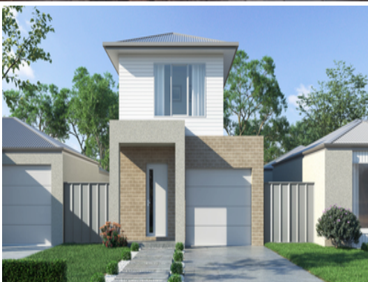
122 Hamilton Steet KILMORE, VIC