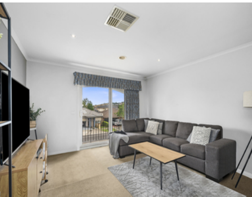
49 Lamour Avenue SOUTH MORANG, VIC