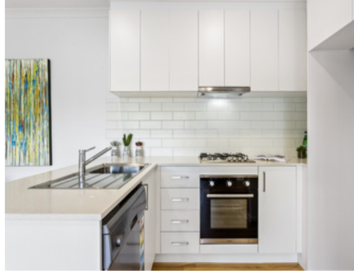
38 Oak Street SEYMOUR, VIC