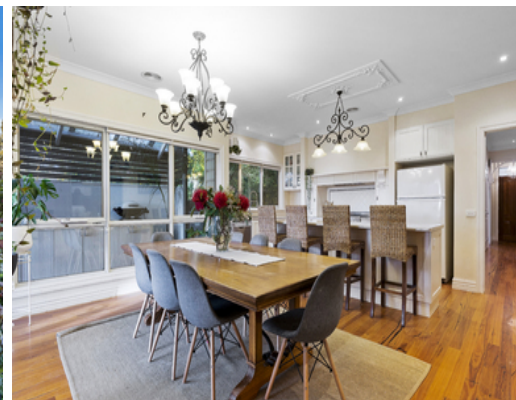
53 East Street KILMORE, VIC