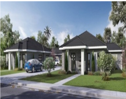
1/149 Dudley Street WALLAN, VIC