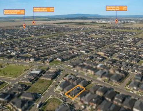
5 Hixon Way MICKLEHAM, VIC