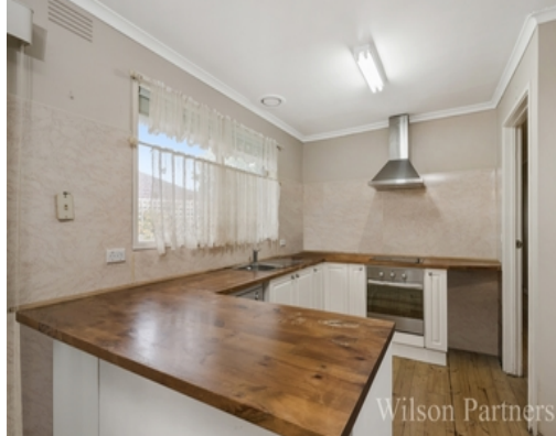
5 Danaher Avenue WALLAN, VIC