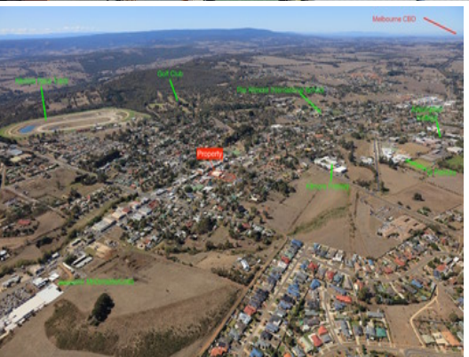
31-33 SYDNEY STREET KILMORE, VIC