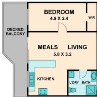
BUNGALOW NOT IN POSITION