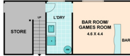
BAR BELOW MASTER BEDROOM