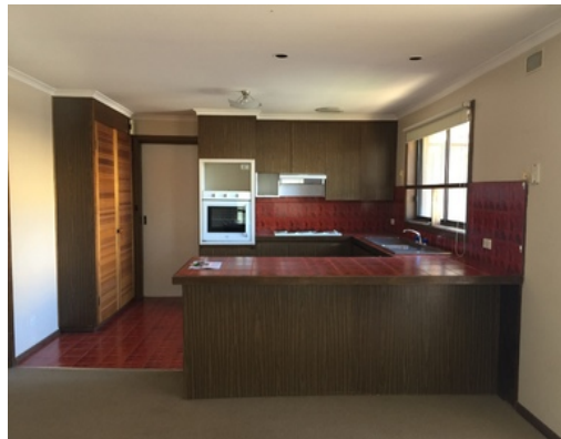
51 Albert Street KILMORE, VIC