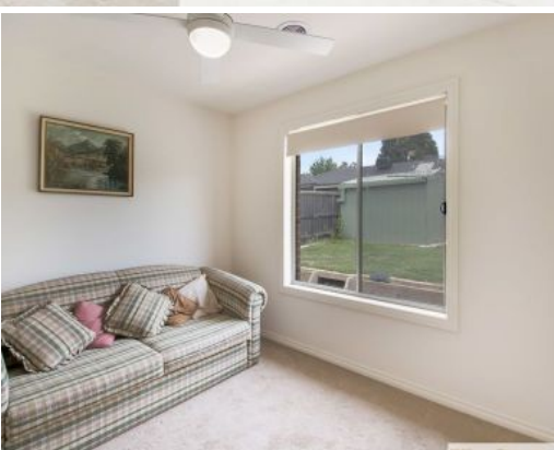
7 Rosie Drive BROADFORD, VIC